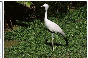
National Bird of South Africa