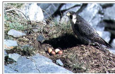
Fastest flyer = Peregrine falcon