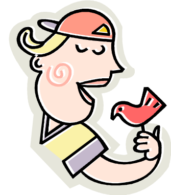
A bird in the hand is worth two in the bush